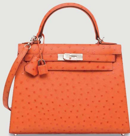
A TANGERINE OSTRICH SELLIER KELLY 28 WITH PALLADIUM HARDWARE