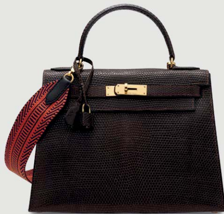
A SHINY ÉBÈNE LIZARD SELLIER KELLY 28 WITH GOLD HARDWARE &